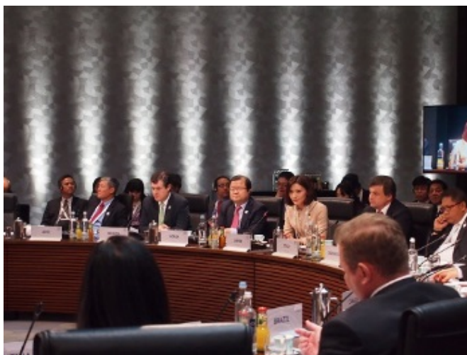
photo:G20 Digital Ministers' Meeting

The Ministerial Declaration reflects the basic concepts of the promotion of the free flow of information and the improvements in access to ICT as agreed at the G7 ICT Ministers' Meeting in Takamatsu, Kagawa, in April 2016. It can be said that the outcome of this G7 Meeting has been widely spreading to other countries beyond G7.