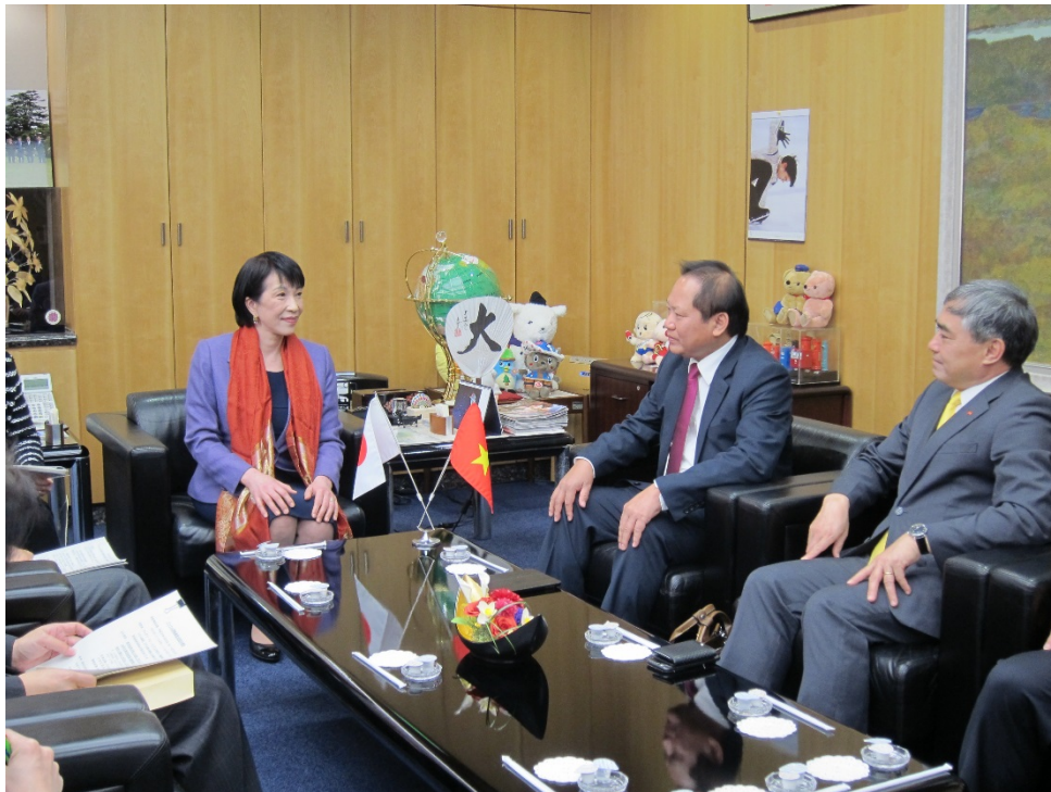
Photo : talking with H.E. Mr. Truong Minh Tuan, Minister of Information and Communications of the Socialist Republic of Vietnam

Sanae Takaichi, Minister for Internal Affairs and Communications, held talks with H.E. Mr. Truong Minh Tuan, Minister of Information and Communications of the Socialist Republic of Vietnam, who visited Japan on March 29, 2017. They agreed to establish a Joint Working Group and further promote cooperation between the two countries in the ICT and postal fields.