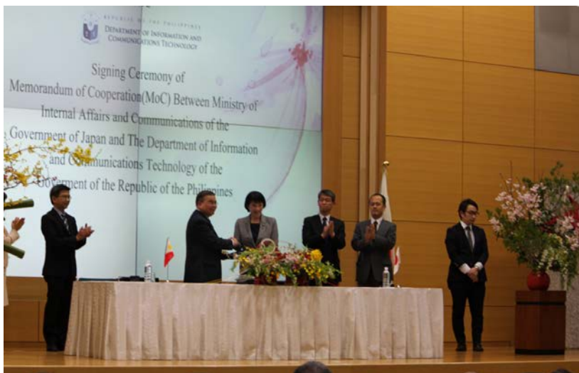
Photo : Minister Takaichi's signing of MOC in the ICT field.