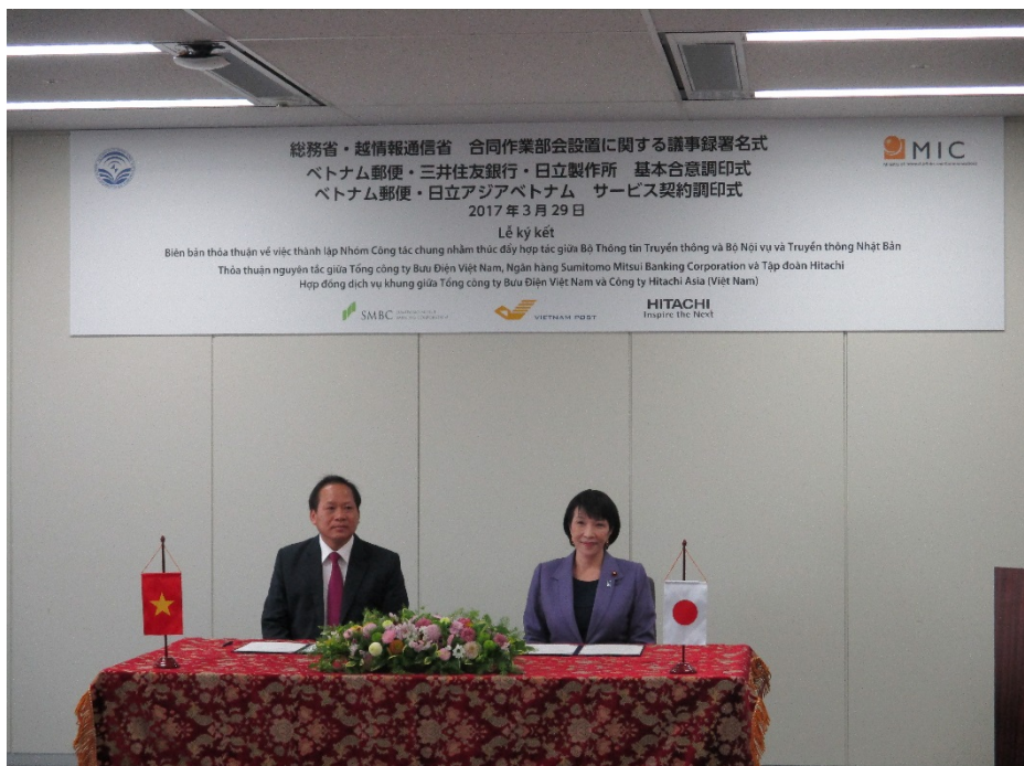
Photo : signing of Joint Minutes on Establishment of Joint Working Group for Promoting Corporations

3. Witnessing of the Signing of Agreements of Japanese Companies and Vietnam Post Sumitomo Mitsui Banking Corporation and Hitachi Ltd. jointly signed an Agreement in Principle to Support Digitalization of Financial Services with Vietnam Post under the presence of Minister Takaichi and Minister Tuan. Furthermore, Hitachi Asia (Vietnam) Co., Ltd. and Vietnam Post signed a Master Service Agreement on the provision of services to realize the digitalization of financial services under the presence of the Ministers as well.