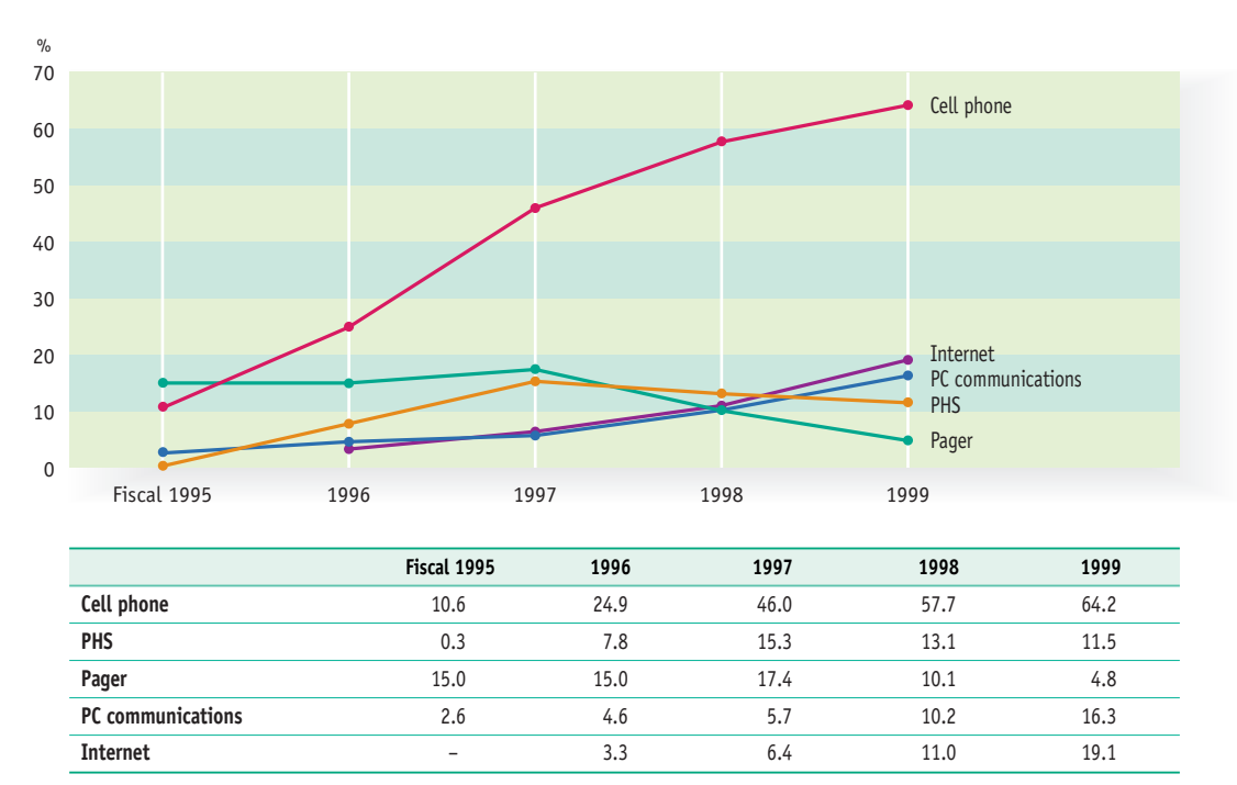
Exhibit 43. Percentage of Japanese Households Subscribing to Communications Services

The fiscal 1999 edition of Basic Survey on