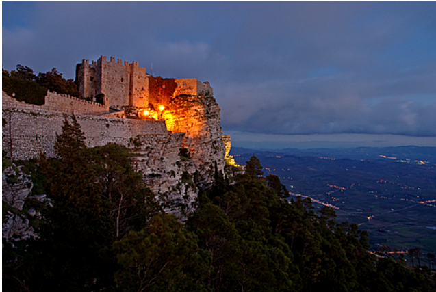
FIGURE 3 Castle of Venus and the Cathedral, Erice, Sicily