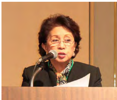
Ms. Conchita Carpio Morales Vice President of Asian Ombudsman Association Ombudsman, PHILIPPINES

Good day to my esteemed colleagues in the public sector, ladies and gentlemen.