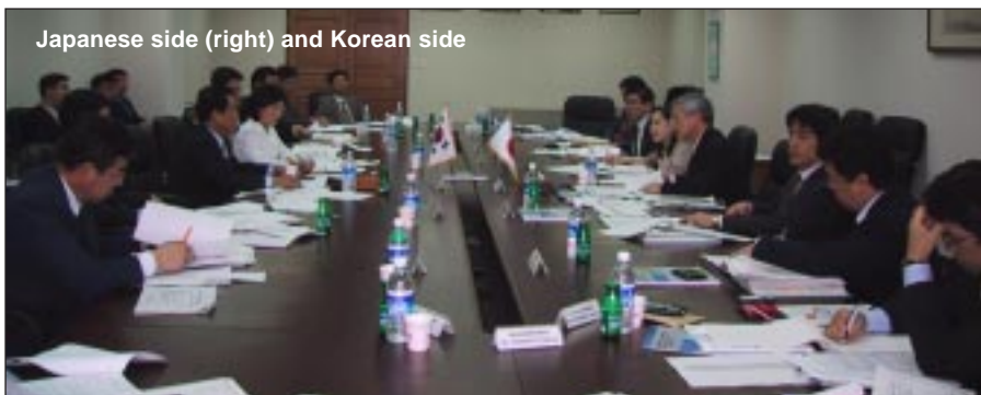
Japanese side (right) and Korean side