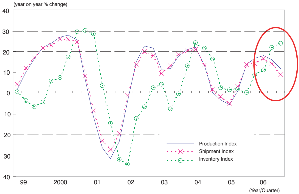
Figure 1: State of Production, Shipments and Inventories for the Information and Communications Manufacturing Industry (year on year)

NB: Produced by calculating the primary coefficient from the production, shipment and inventory indices for mining and manufacturing Data: METI "Indices of Industrial Production"