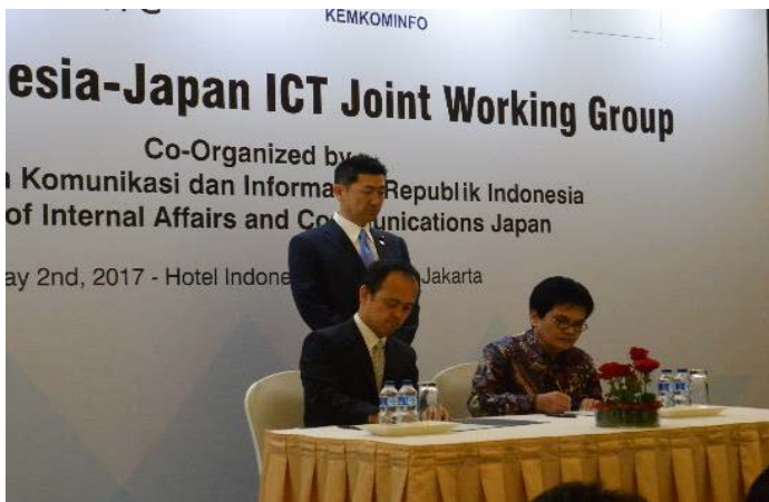
Photo: Witnessing the signing of Document on their cooperation of ICT Joint Working Group