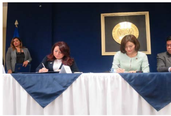
Photo: Signing of MoC on terrestrial digital cooperation