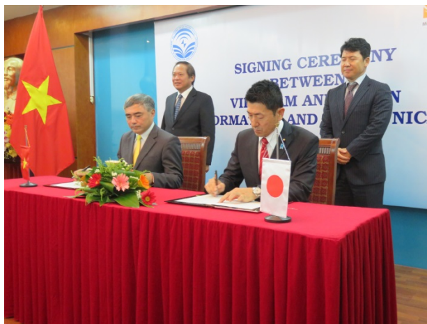
(Photo: State Minister Akama’s signing of the MOU Renewal on the Postal Field between Japan and Vietnam)

The existing MOC in the Postal Field was valid until September this year, and then the State Minister for Internal Affairs and Communications of Japan and Vice Minister of Information and Communications of Vietnam signed the renewal of the MOC in the Postal Field. Furthermore, they reached an agreement on promoting the cooperation between the postal designed operators of both countries and the cooperation between Japanese companies and Vietnam Post.