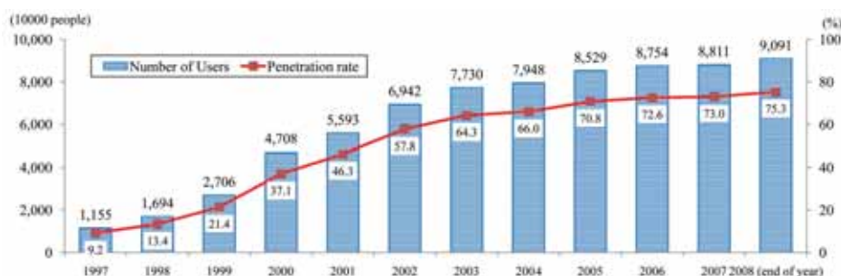
Figure 4-1 Changes in the number of Internet users and the penetration rate

(Source) Survey on ICT Utilization (2008), Ministry of Internal Affairs and Communications