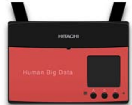
Nameplate type sensor