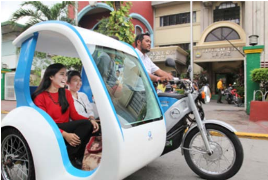
Tricycle in Philippines