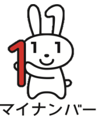
【My Number HP QR Code】

The 'Notification Card' is made of paper and it shows the 12 digit My Number in the front. There is no photo of the card holder, and the card cannot be used as an identification document.