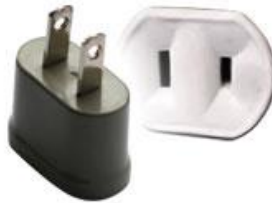
Type A plug

The standard power supply in Japan is 100 volts. The frequency is 60 Hz in western Japan including Fukuoka. The type of power outlet/connector used in Japan is “A type” which is a two-parallel-pronged type. For your convenience, please bring a multi-voltage travel adapter.