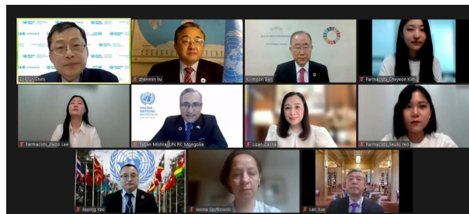
Screenshot from the 5th Regional Symposium

November 16-18, 2021 – The United Nations Department of Economic and Social Affairs (UN DESA) Division for Public Institutions and Digital Government’s (DPIDG’s) United Nations Project Office on Governance (UNPOG) celebrated its 15th anniversary in its recently conducted 5th Regional Symposium on Effective Public Governance and Digital Transformation for Building Back Better. Since its establishment in June 2006, UNPOG has been a strong partner in advancing efficiency, participation, and transparency in the governments of its Member States. It has likewise contributed in the efforts to strengthen capacities of developing countries in terms of reinventing public administration and coping to the demands of the rapidly changing environment.