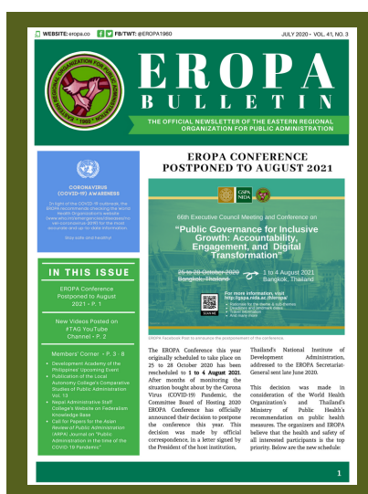
Cover Pages of the Last 2 Published Issues of the EROPA Bulletin