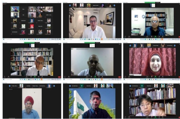
Plenary session screenshot