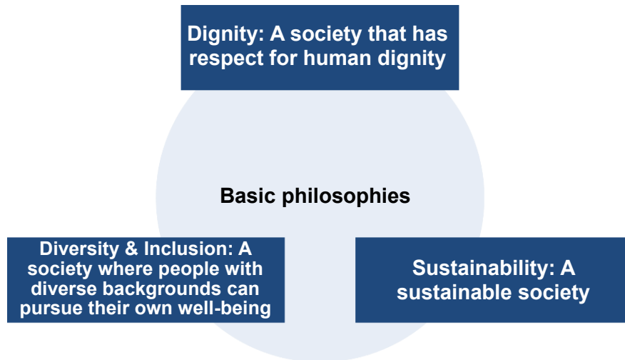
Figure 5. Basic philosophies

These fundamental concepts remain goals for us to achieve and do not change despite significant technological evolution. Therefore, these basic philosophies should be respected as objectives to achieve through domestic and international frameworks as AI evolves.