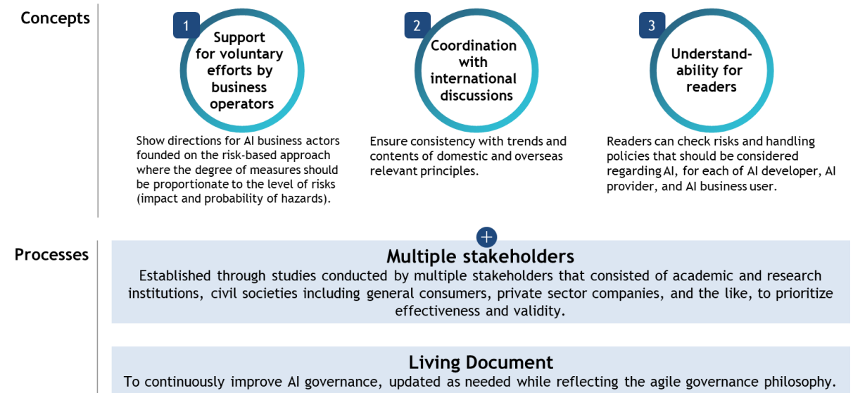
Figure 2. Basic concepts of the Guidelines

Trends in AI are rapidly changing, and in light of international discussions and other developments, it is planned that the Guidelines will be appropriately updated as a living document, including the definitions and other content herein, with multiple stakeholder engagement, while reflecting the agile governance philosophy toward the continuous improvement of AI governance 5 . In such activities, it will be determined how the guiding principles and implementation should be updated as the countermeasures against risks in accordance with maturity of AI in the society. (See “Figure 2. Basic concepts of the Guidelines.”)