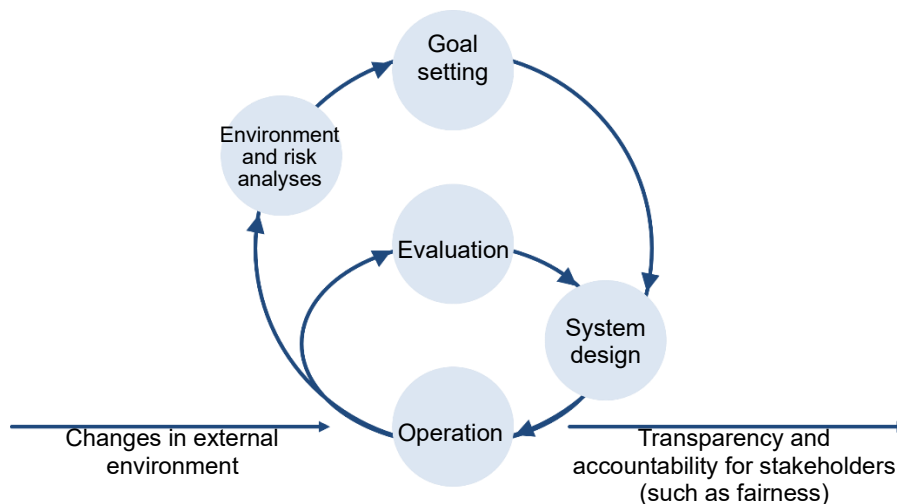
Figure 6. Basic model of agile governance

Furthermore, when studying AI governance, it is important to keep in mind the value chain and pay close attention to the following points.