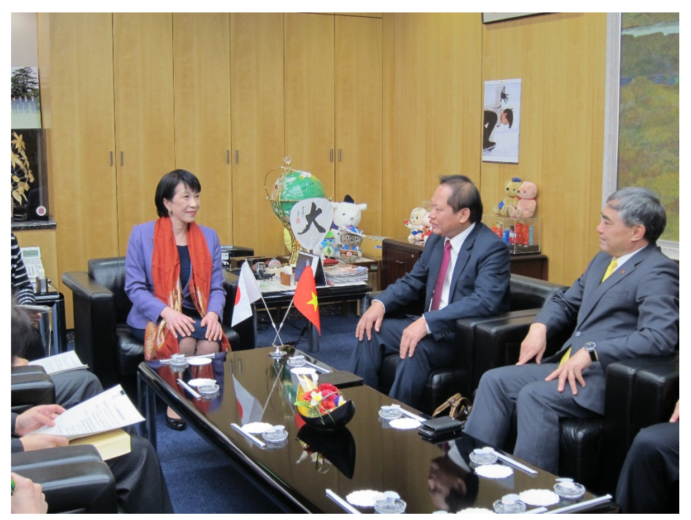
Photo: talking with H.E. Mr. Truong Minh Tuan, Minister of Information and Communications of the Socialist Republic of Vietnam

Results of Talks with Sanae Takaichi, Minister for Internal Affairs and Communications, and H.E. Mr. Truong Minh Tuan, Minister of Information and Communications of the Socialist Republic of Vietnam