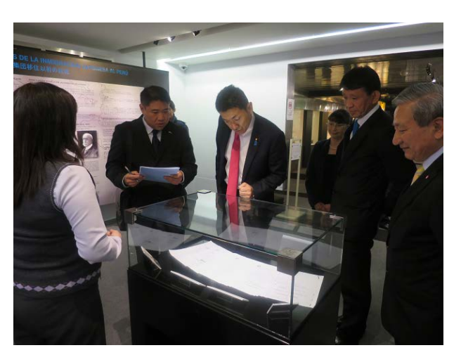
Photo:State Minister Akama's visiting the Japanese-Peruvian Association

(3) Exchanges with Japanese-Peruvian Community State Minister Akama visited the Japanese-Peruvian Association, and conversed with people of Japanese ancestry and promoted exchanges with them.