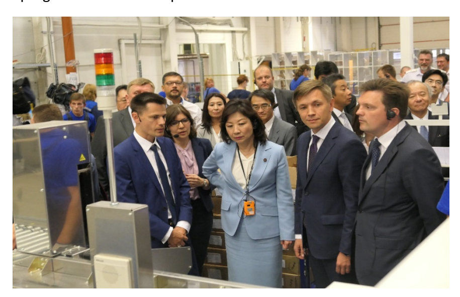
Photo: Observing facilities at the completion ceremony of Vnukovo Logistics Center of Russian Post