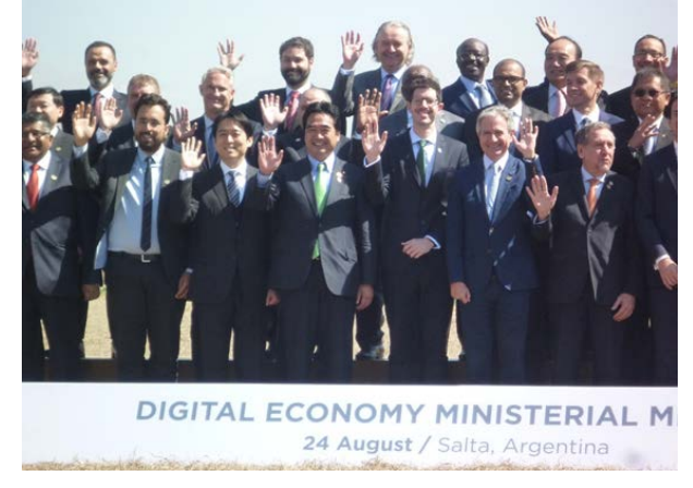
Photo: joining the photo session with every country's ministers ( State Minister for MIC Manabu Sakai is the fourth from the left on the front row)

The G20 countries promote measurement of the world's digital economy objectively, thus making it possible to develop evidence-based policy makings, while evaluating the impact of emerging technologies and innovations on employment and industries, and contributing to the reduction of risks, including income inequality, in particular, associated with the industrial and consumer adoption of technologies.