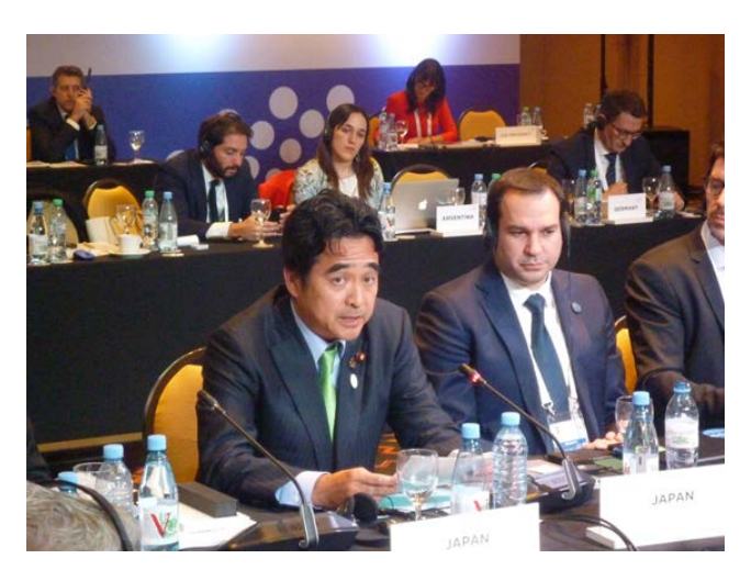
Photo: State Minister for MIC Manabu Sakai made a presentation in the G20 Digital Economy Ministerial Meeting

At this year's meeting held in Argentina, State Minister Sakai represented Japan as the next presidency, and discussed a number of topics, including digital government, emerging technologies, and technological infrastructure development.