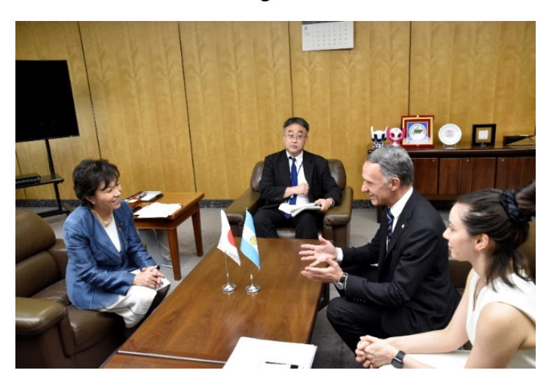
Photo: Yukari Sato, State Minister for Internal Affairs and Communications, in conference with H.E. Mr. Alan BERAUD, Ambassador Extraordinary and Plenipotentiary of Argentina.