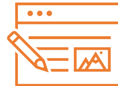
Registrant information Profile