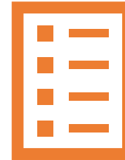
External personnel list (Main)