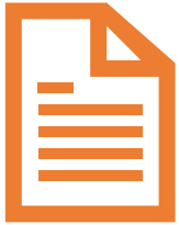
External personnel list Overview

Provided only to local governments considering the use of external personnel lists