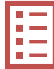
external human resources list (Main)