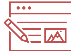
Registrant Information Profile