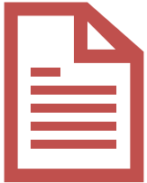
The External Human Resources List Overview

Provided only to local governments considering the use of The External Human Resources List