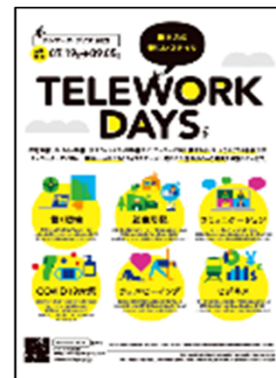
Telework Days 2021 poster